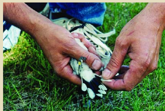
Above: Feathers are collected for stable isotope analysis.

in the feathers, it is hoped that the regions where eastern loggerhead shrikes overwinter can be identified.